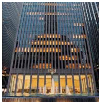
Newmark Grubb Knight Frank was retained as the exclusive leasing agent for 1251 Avenue of the Americas, New York, NY. With 2.1 million square feet of vacant space, a marketing strategy was developed to reposition the building as the preeminent corporate tower on Sixth Avenue. We were successful in securing several prestigious tenants, many of whom signed leases in excess of 200,000 square feet. The building is currently 100% occupied.