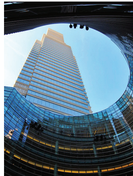
Newmark Grubb Knight Frank represented Bloomberg L.P. in the leasing of 700,000 square feet for its corporate headquarters at 731 Lexington Avenue, New York, NY, developed by Vornado Realty Trust.

Whether selecting a business location, improving a property or portfolio's operating efficiency, identifying investment opportunities,